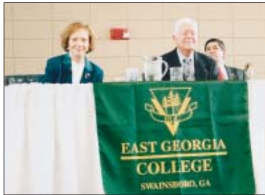
President and Mrs. Jimmy Carter attend the dedication ceremony at East Georgia College's new Classroom/Activity Center.